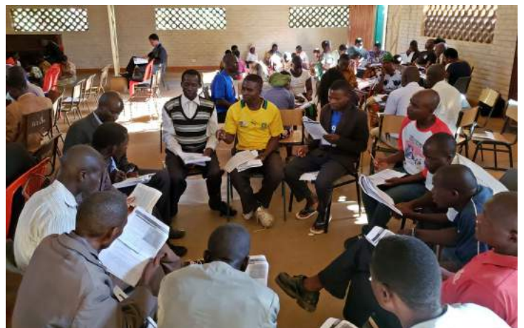
Going through DJJ lessons in Chichewa in Malawi.

To earmark donations for this need, use the enclosed giving slip and mark the Materials/Translations box.