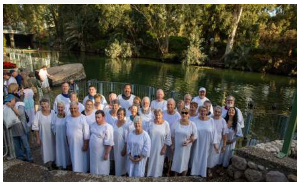
Jordan River Baptism

For more information, please email us today.