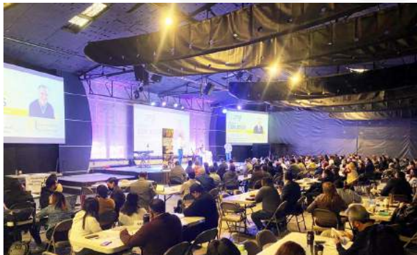
Partnership Training Mexicali, Mexico

Discipleship Lessons and Videos: 52 New Testament lessons have been released! 52 Old Testament lessons have been written, tested, and are being developed for release. Altogether they cover 104 topics that bring believers to maturity in Christ. In addition, 208 short videos have been recorded in the Bible lands (Israel, Egypt, Turkey, Greece, and Italy) to accompany the lessons. The Old Testament videos are now in post-production and will be completed as soon as we have funding.