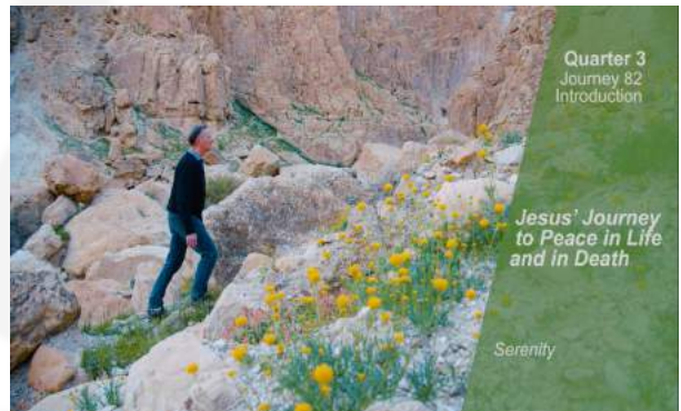
Videos recorded in Bible lands