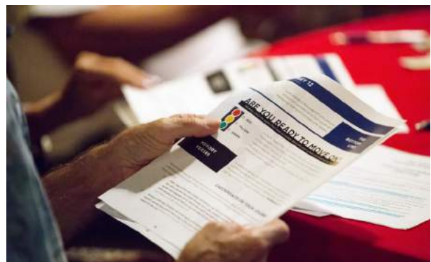
New Testament Quarter 1 released September 2017

Discipleship Lessons and Videos: 52 New Testament lessons have been released! 52 Old Testament lessons have been written, tested, and are being developed for release. Altogether they cover 104 topics that bring believers to maturity in Christ. In addition, 208 short videos have been recorded in the Bible lands (Israel, Egypt, Turkey, Greece, and Italy) to accompany the lessons. The Old Testament videos are now in post-production and will be completed as soon as we have funding.