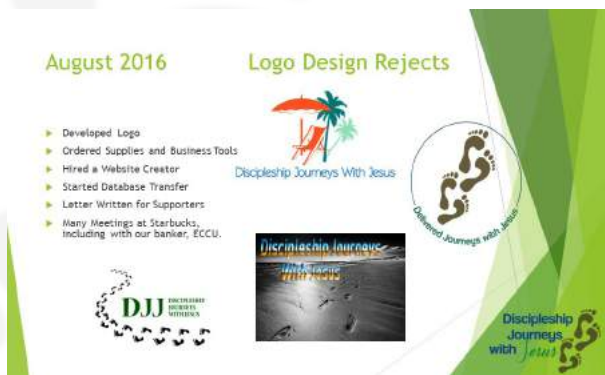
Starting the ministry and logo creation

Six years ago, on September 20, 2016, Discipleship Journeys with Jesus was launched. We began with a dream and vision: we had no lessons, minimal donors, infrastructure or website, virtually nothing. What has happened in six years?